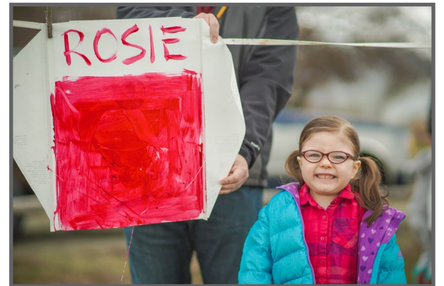
Kids enjoy creating and flying kites at Entiat Kite Fest

The Entiat Earth Day took place at the school on April 20 and Cascadia was excited to participate. The entire elementary school, about 165 kids, participated in this fun event organized by the Entiat Valley Community Services Group. Several different organizations had booths set up with entertaining and educational activities. Cascadia brought our table length fish anatomy puzzle. This beautifully crafted wood puzzle depicts the internal and external organs of a fish. We played a game of Fish Anatomy Jeopardy with the students, where we would describe a fish organ and they would guess the part, then place it in the puzzle. The students also enjoyed doing fish origami as another component of Cascadia's station.