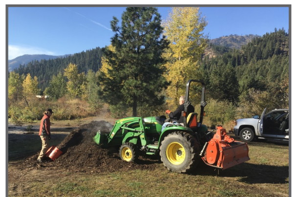
Wood chips from Chelan free dump days being used for restoration projects