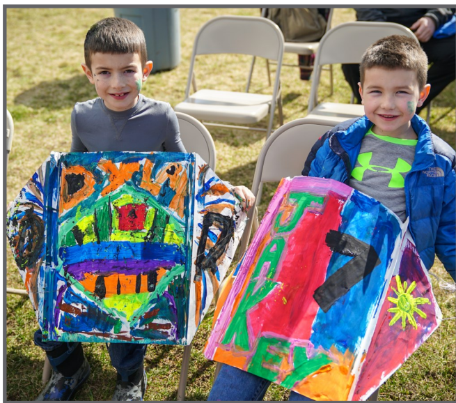
Kids enjoy creating and flying kites at Entiat Kite Fest

As many of the private landowners are aware, the Entiat is a very busy and highly monitored river. With several habitat projects already constructed, Cascadia has been actively engaging multiple landowners in preparation for the next round of implementation. In the years 2017 and 2018, Cascadia, Chelan County Natural Resource Department, Yakama Nation Fisheries, and Cascade Columbia Fisheries Enhancement Group will be working to complete several new habitat projects in the Middle Entiat. These entities have been working with about seven private landowners and two organizations within the project areas, the US Forest Service and the Chelan-Douglas Land Trust. They have been coordinating together to plan and collect data. The projects are currently heading into the final design phase and a public meeting will be coming up soon to review the final plans and the draft Environmental Assessment. For additional information, contact Jason Sims at jasons@cascadiacd.org or (509) 436-1601.