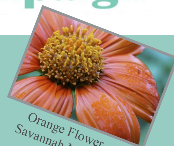
Orange Flower Savannah Meiners

Visit www.cascadiacd.org for complete contest rules & details and to submit your photo(s)!