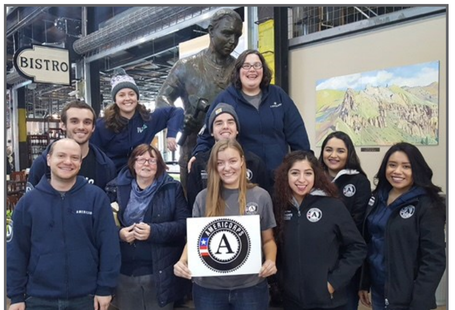
Photo on the right: AmeriCorps members during Martin Luther King, Jr service day at Pybus Public Market in Wenatchee.

For additional information on AmeriCorps and this position please visit: https://washingtonservicecorps.org/become-a-member/how-to-apply/wsc-positions/ or call (509) 436-1601.