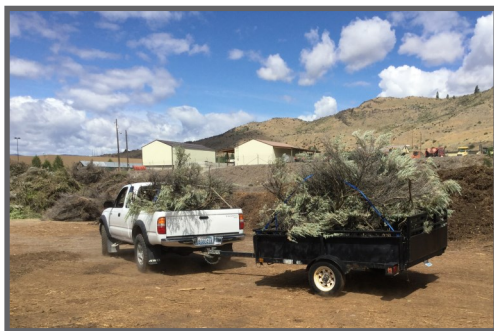
About 200 yards of material was collected during the Chelan Transfer Station free yard waste dump days in 2016

In 2016, Cascadia, the WA Department of Natural Resources, Chelan County Natural Resources Department, the City of Chelan, and Department of Ecology partnered to offer three weekends where residents of Chelan and the surrounding area could dump their yard waste for free! This program was very successful in helping landowners prepare their properties to be more resilient in the face of wildfires. Over 50 landowners participated in dumping about 200 yards of material on these weekends.