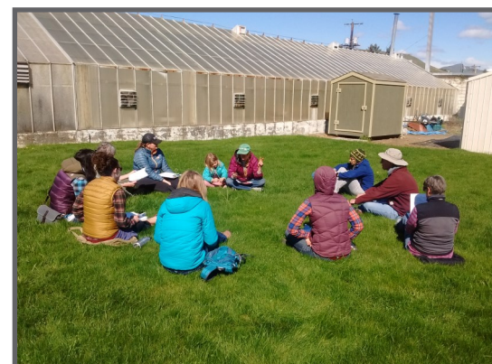
Backyard Gardening workshop participants

Wondering how to save seeds or preserve all those tomatoes? Perhaps you could use some advice on how to prune trees properly or create a new worm bin, chicken coop, berry patch or flower border. If you have ideas on future agriculture workshops or general gardening questions, please let us know! Cascadia would like to hear from you so we can continue to offer classes that will interest and serve this community!