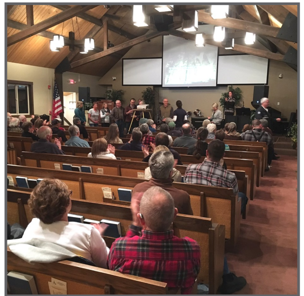
New Firewise communities recognition ceremony during the Era of Megafires event