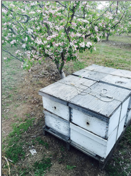
Bee box hosting a colony of bees

Many of the recommendations from the work group will require new funding. Please consider the public good honey bees provide and support legislation that seeks to improve honey bee health. Honey bees make it possible for us to grow the healthy, delicious fruits that enhance our lives and play such a large part in the state's agricultural sector.