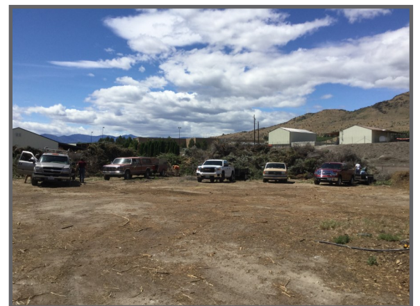
Over 50 landowners participated in the Chelan free yard waste dump days in 2016

The City of Leavenworth is offering free yard waste disposal (four bags per week) with your regular garbage service from April 4-May 11. For additional information contact: www.cityofleavenworth.com or (509) 548-5275.