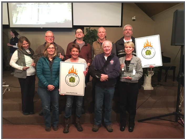
Representatives of the newly formed Firewise communities in Plain and Lake Wenatchee

Washington state led the nation in 2016 for the number of new Firewise communities formed, and Chelan County had the highest number of new communities in the state! This great work is a testament to the motivated residents of Chelan County who are very dedicated to protecting their communities as well as the great partnerships between these communities, Cascadia, WA Department of Natural Resources, and other partners like the Chumstick Wildfire Stewardship Coalition.